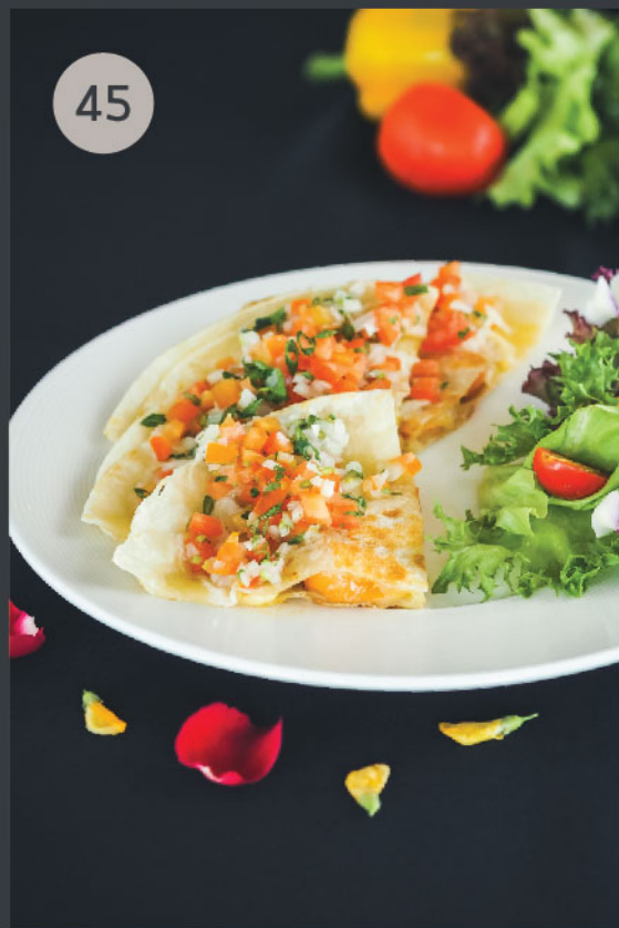
PEPPA PIG'S Sausage quesadilla THB150