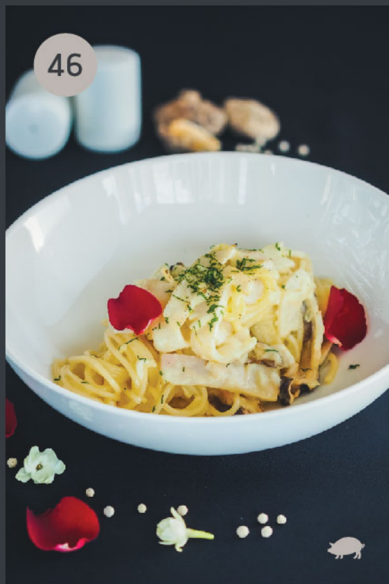
SNOW WHITE Spaghetti and cooked ham THB150