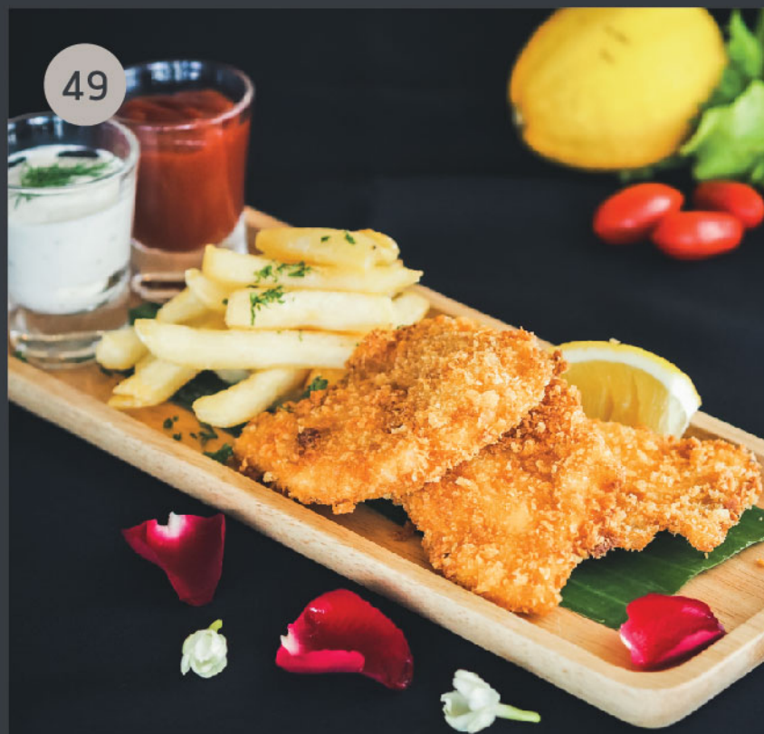
TWEETY Chicken nuggets with tartar sauce THB150