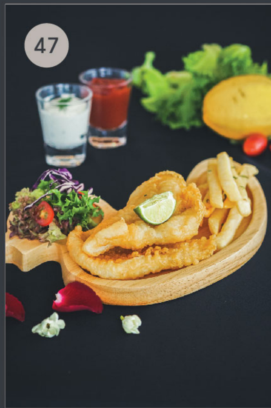
DAFFY DUCK'S Crispy fish and chip THB150