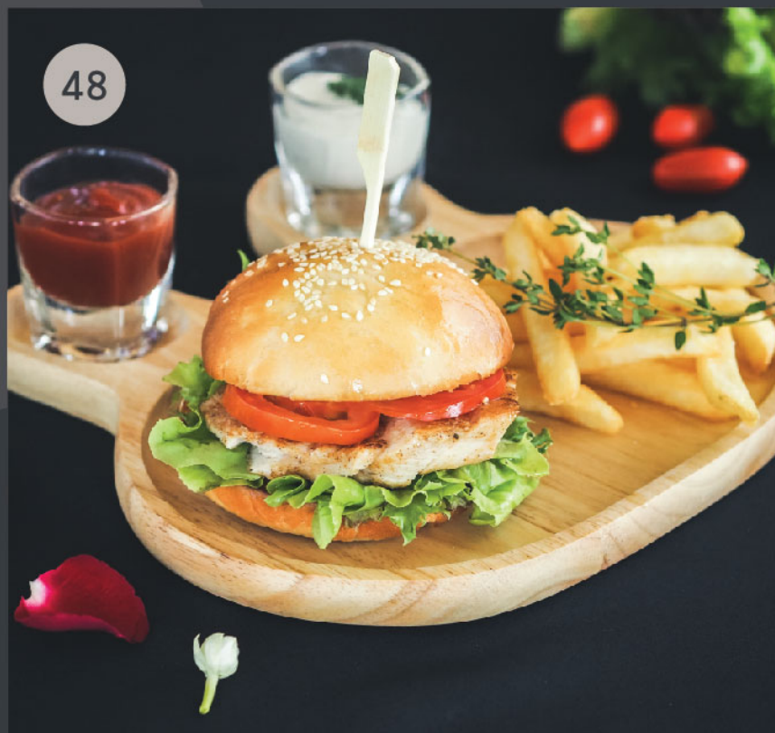
BOB THE BUILDER Mini chicken burger THB150